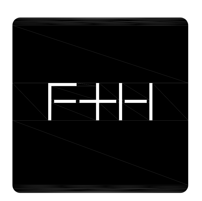
Fletcher + Hardoin Architects